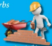
vaka - build